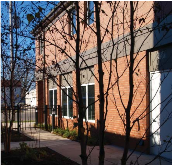
Parade Street Work Live Complex Housing Authority of the City of Erie