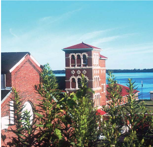
Erie Water Works Administration Building Erie, Pennsylvania