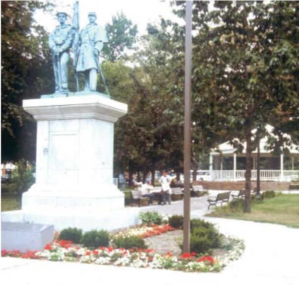
Perry Square Erie, Pennsylvania