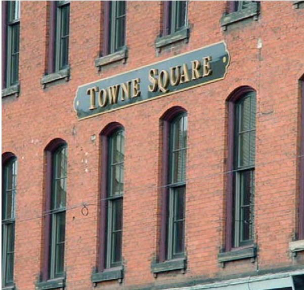
Towne Square Adaptive Re-Use Titusville, Pennsylvania