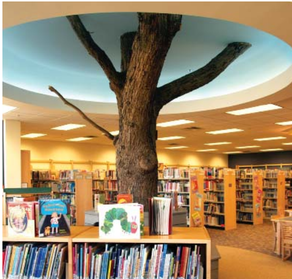
Northland Public Library Pittsburgh, Pennsylvania