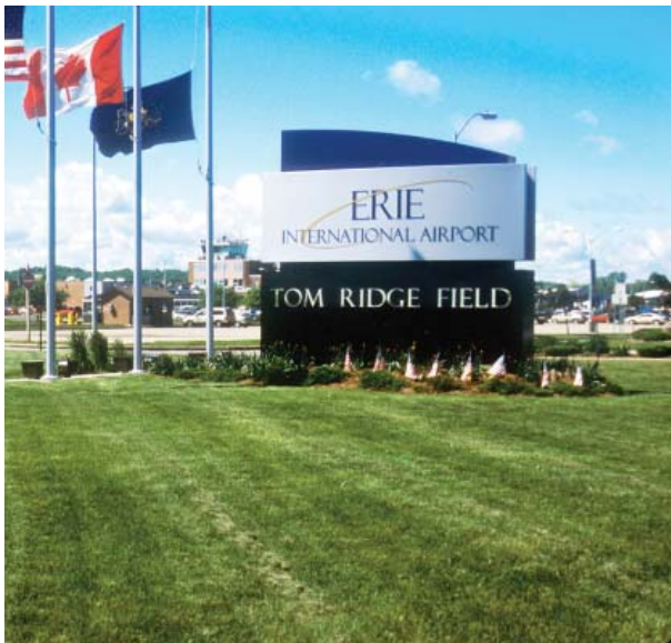
Erie Airport Improvements Erie, Pennsylvania