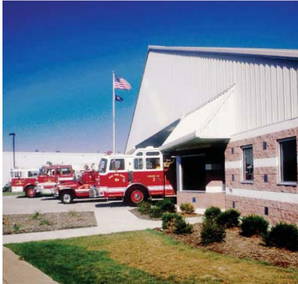
Erie Fire Station Erie, Pennsylvania