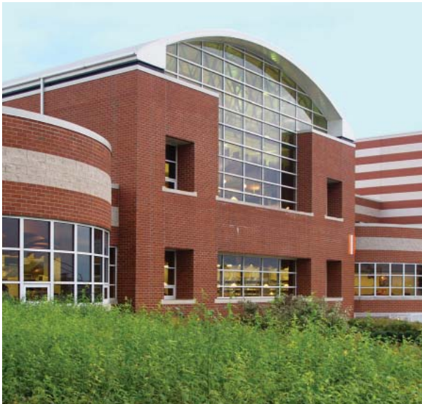
Children's Expansion Blasco Memorial Library