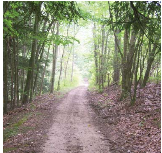
Queen City Trail Oil Regional Alliance