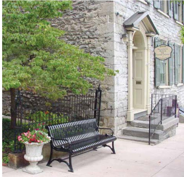
Streetscape Bellfonte Borough, Pennsylvania