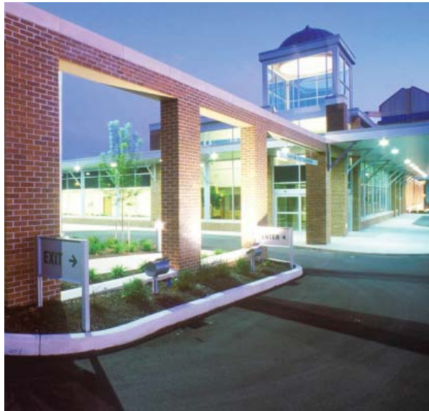
Ambulatory Surgery Center Hamot Medical Center