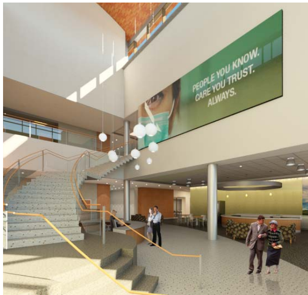
Vernon Medical Office Building Complex (Building 1) Meadville Medical Center