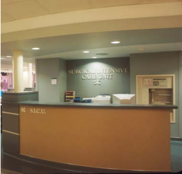
SICU Renovations MetroHealth System