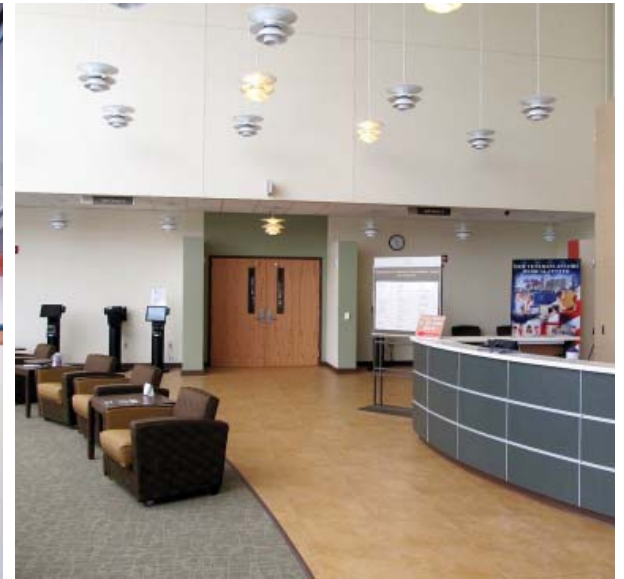
Specialty Clinics Expansion VA Medical Center Erie