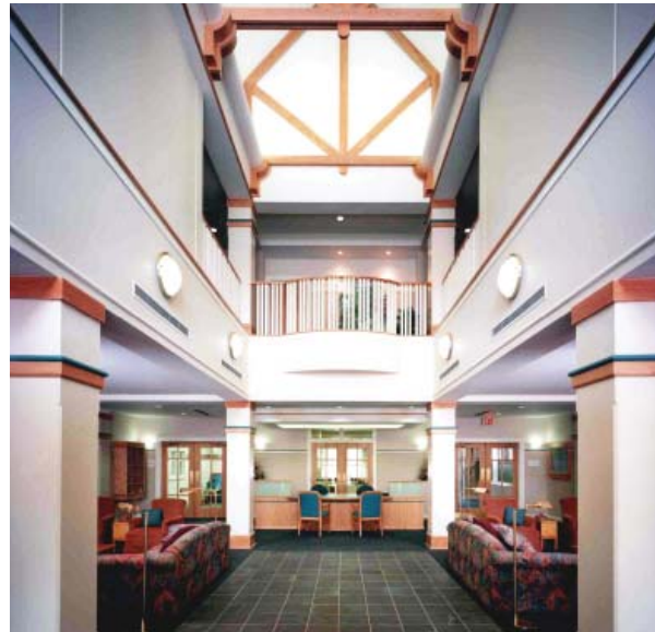
Ronald McDonald House Cleveland, Ohio