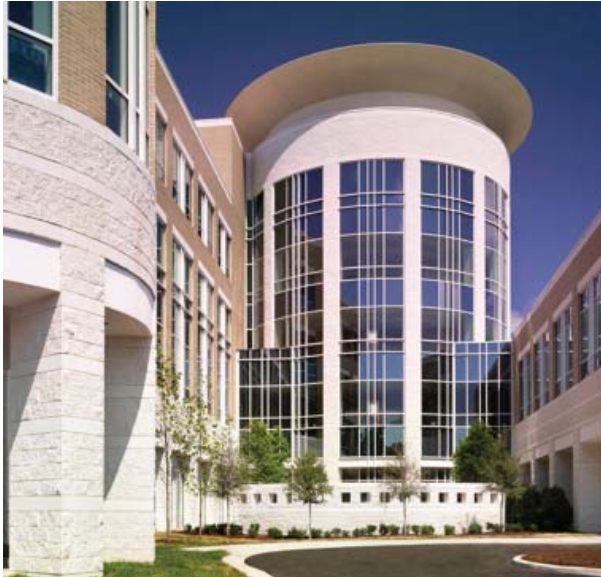
Patewood Hospital Greenville Health System (Tom Duffy with previous firm)