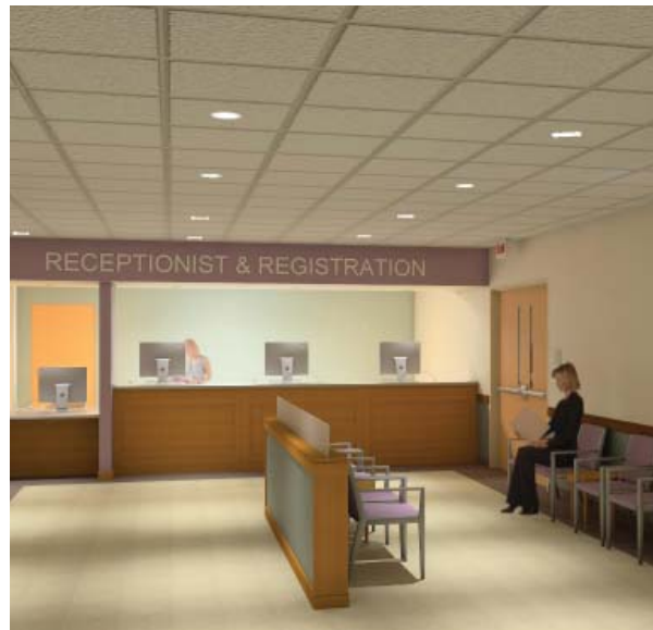
Specialty Clinics Renovation VA Medical Center Asheville, NC