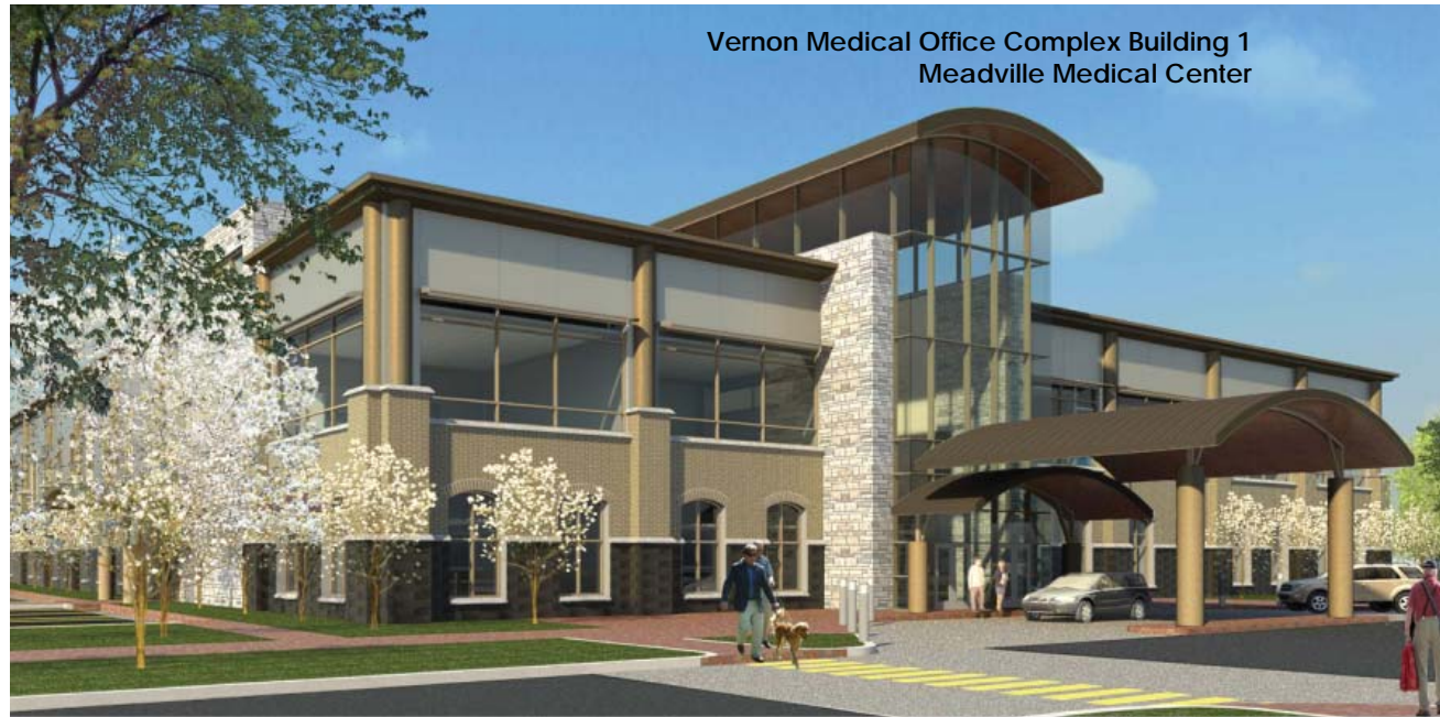
Vernon Medical Office Complex Building 1 Meadville Medical Center

Healthcare Design Magazine Architectural Showcase