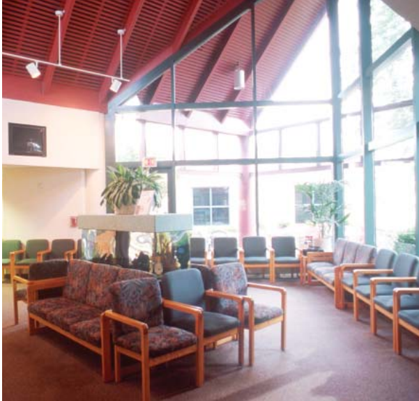
Cancer Center Addition The Regional Cancer Center