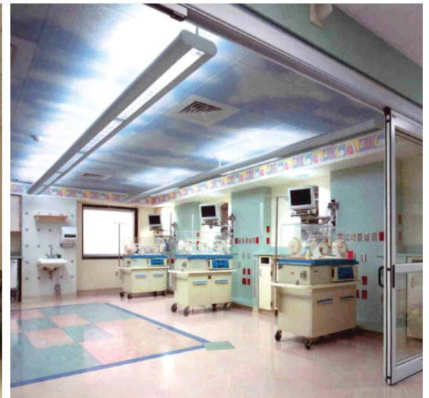
NICU Renovations MetroHealth System