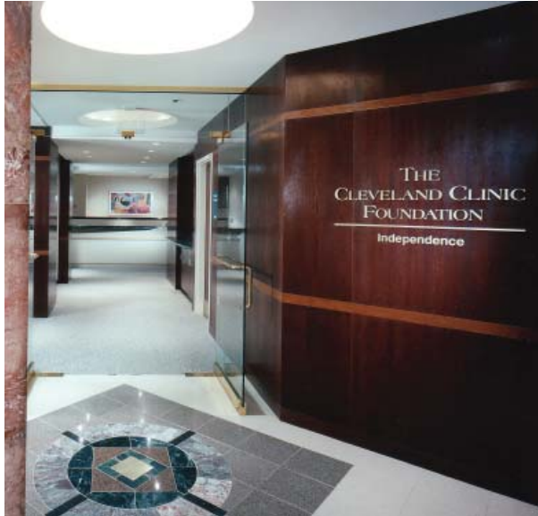
Independence Family Health Center Cleveland Clinic Foundation