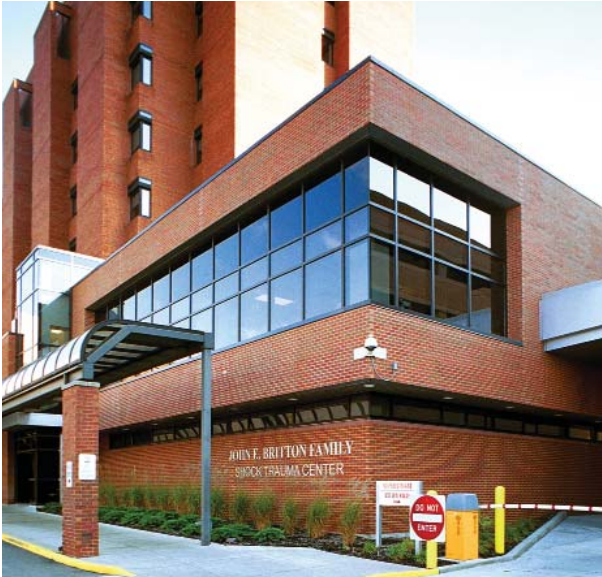
Emergency Room Expansion Hamot Medical Center