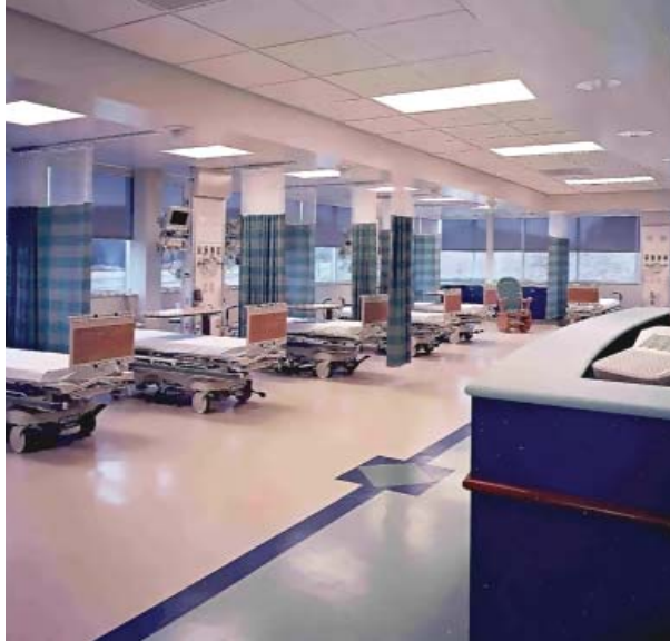
Recovery Area Marymount Hospital