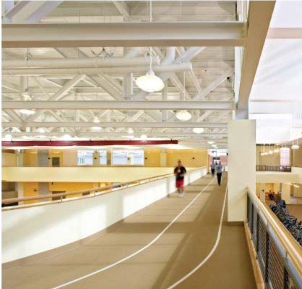
New Recreation Center Cleveland State University