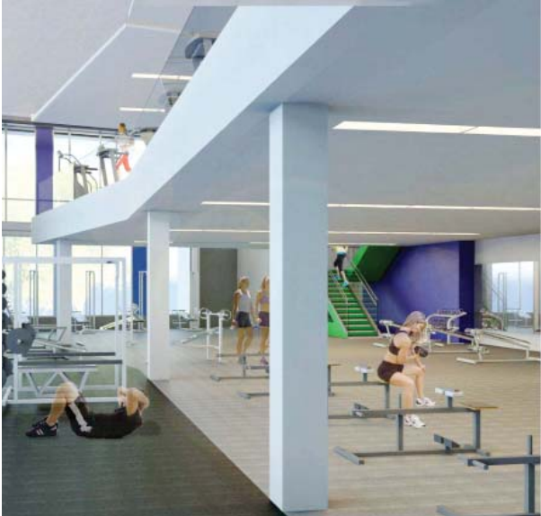
Adler Recreation Complex Penn State Altoona