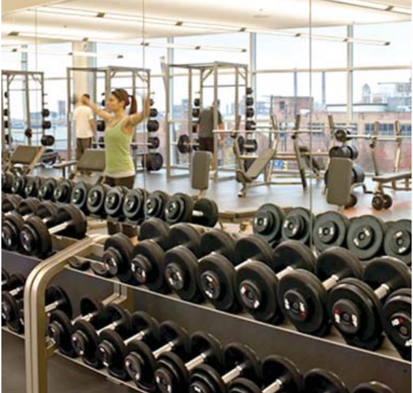
New Recreation Center Cleveland State University