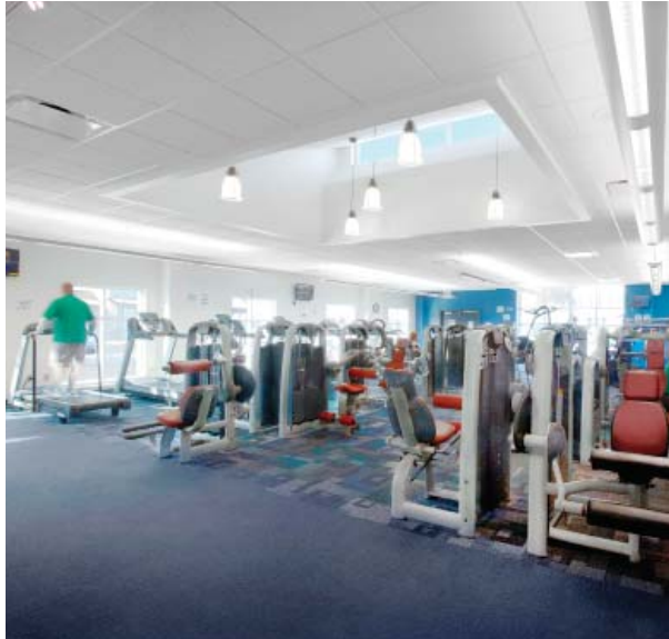
YMCA Expansion and Renovation Titusville YMCA