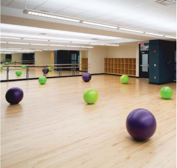
Wellness Center Expansion Cuyahoga Community College