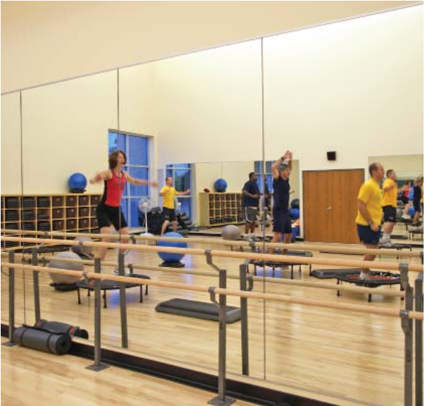
Glenwood Branch Expansion YMCA of Greater Erie