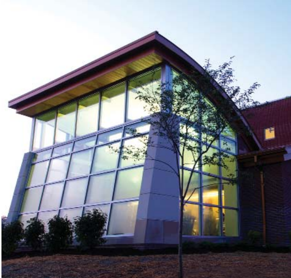
Glenwood Branch Expansion YMCA of Greater Erie