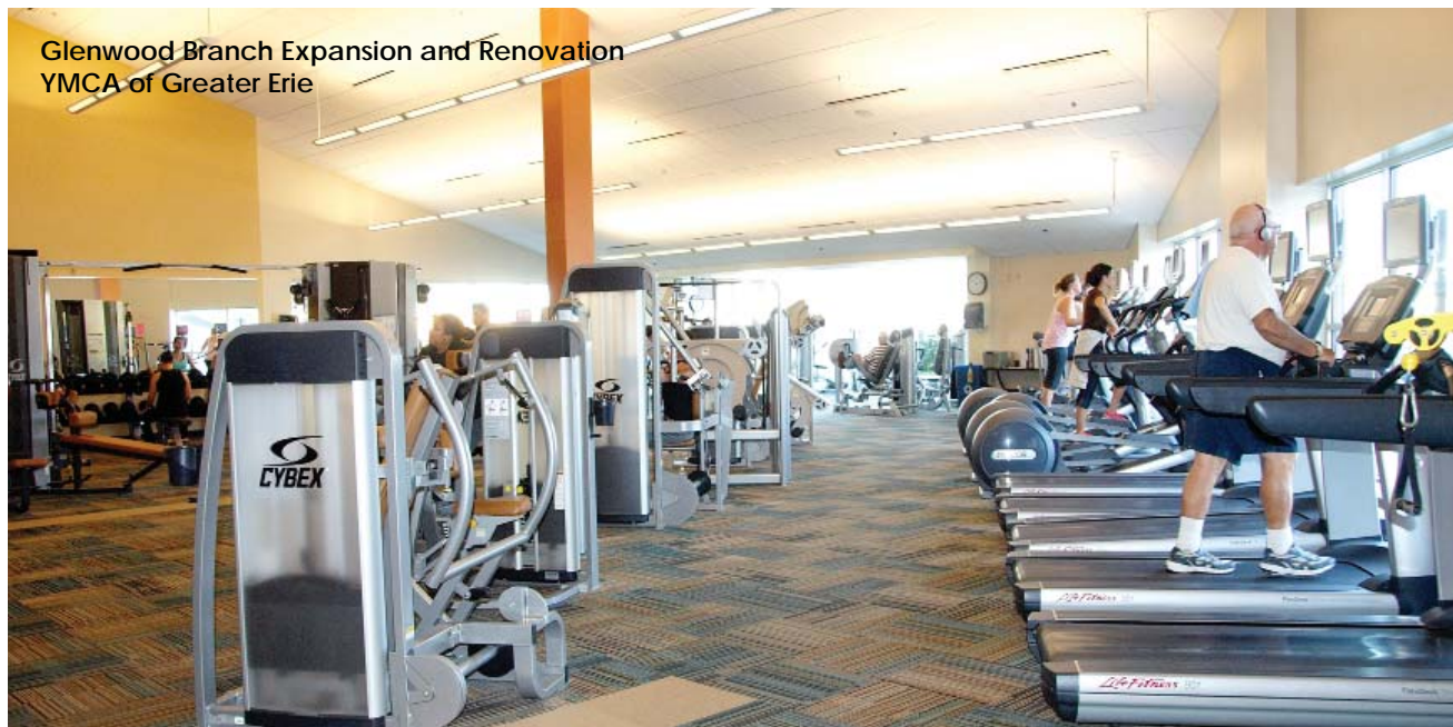
Glenwood Branch Expansion and Renovation YMCA of Greater Erie