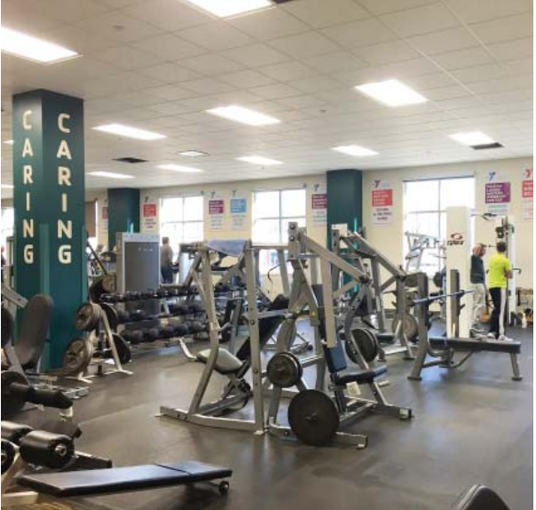
New Vernon Branch YMCA Meadville