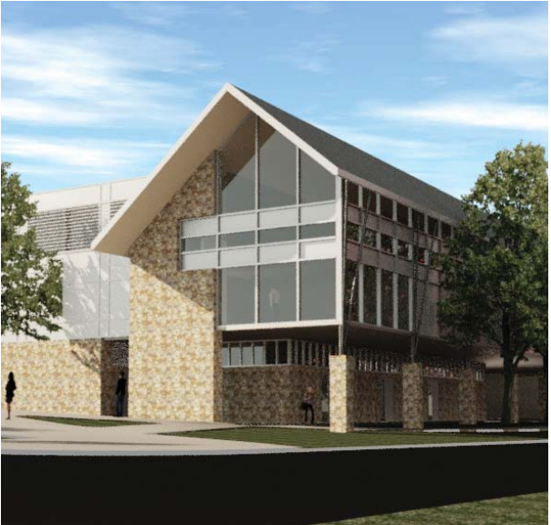
Wellness Center Expansion Study Penn State Behrend