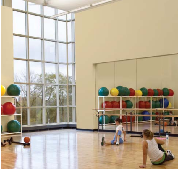
New Recreation Center Cleveland State University