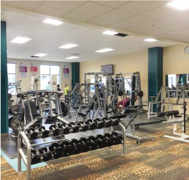
New Vernon Branch YMCA Meadville