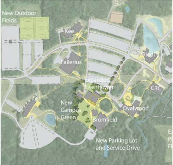
Campus Recreation Master Plan Ohio State University Mansfield